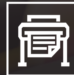
PRINT & DESIGN